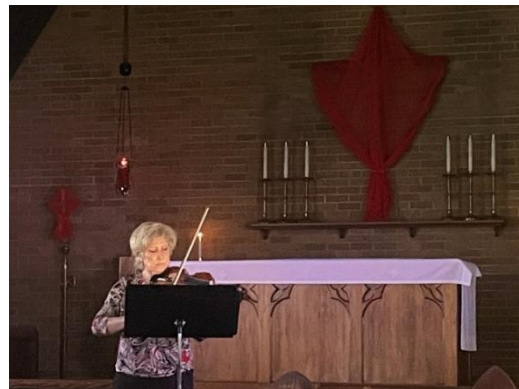
Our last Lenten Quiet Time